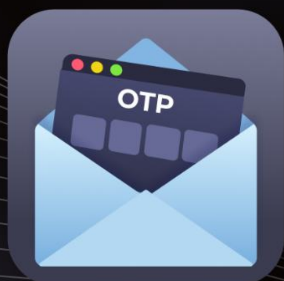
OTP via Mail