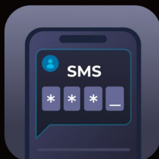
OTP via SMS